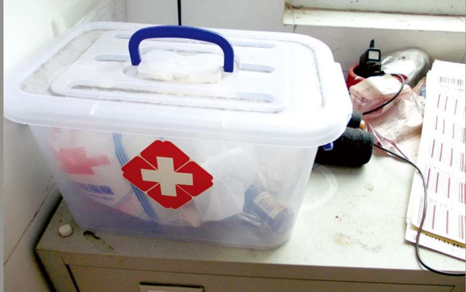
Many young workers have limited access to healthcare

connected to the cities even though they live in them. Except for local workers and local landlords, they rarely communicate with local residents or mix with them. Dialect is often also a natural barrier which separates them from local residents.